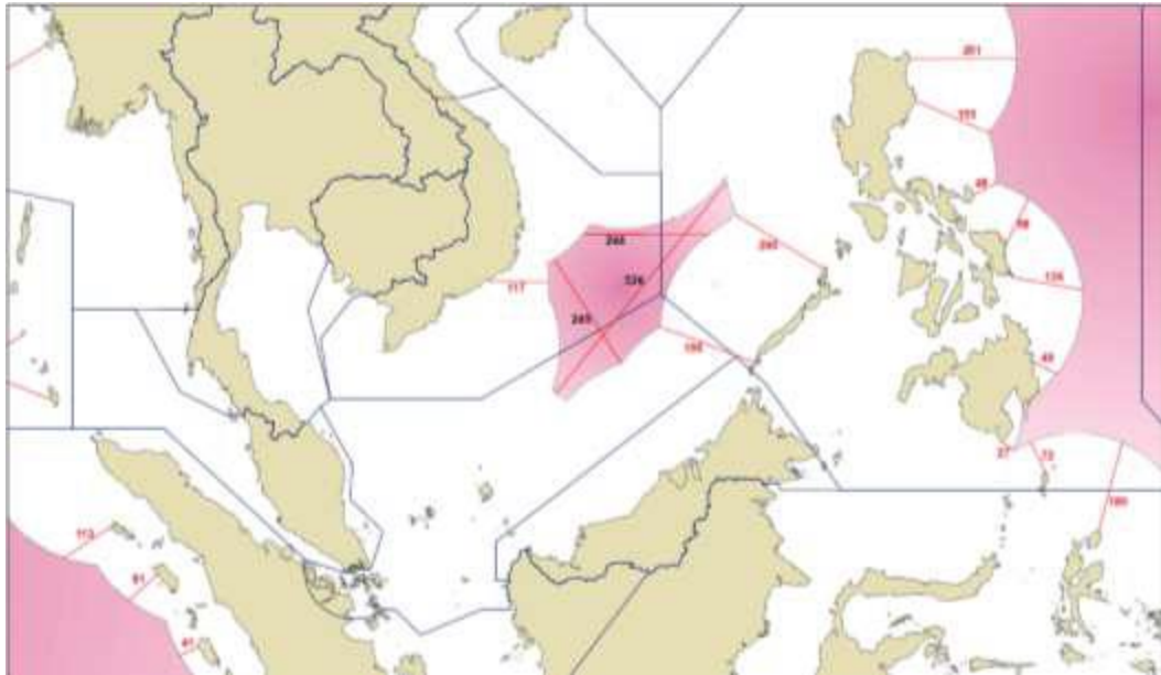
Figure 1: South China Sea ATS surveillance gaps stated in Asia/Pacific Seamless ATM Draft Plan V 0.9b - (Figure 3/p.24)